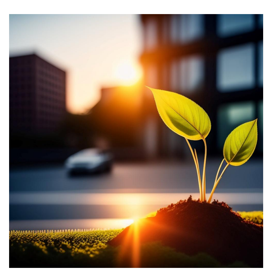
Market Trends for Sustainability Recruitment, ESG and Renewable Energy Jobs.